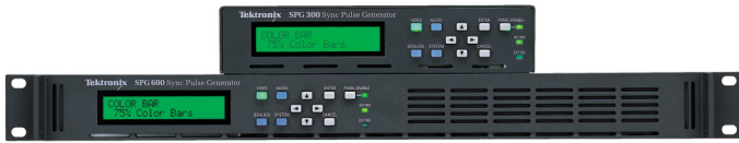
The Sync signal generator family SPG600 (full rack width) and SPG300 (half rack width).